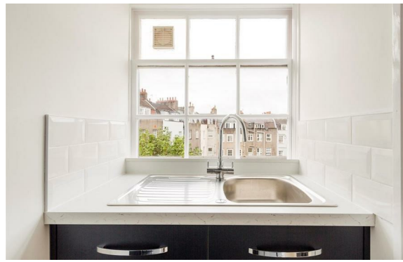
A charming and cosy top floor apartment with communal garden views.